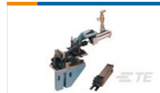
TE Part # 565747-1 STDSTAEMPR180F K